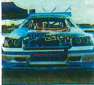
Platinum Raceway presents the Dingane's Raceday!