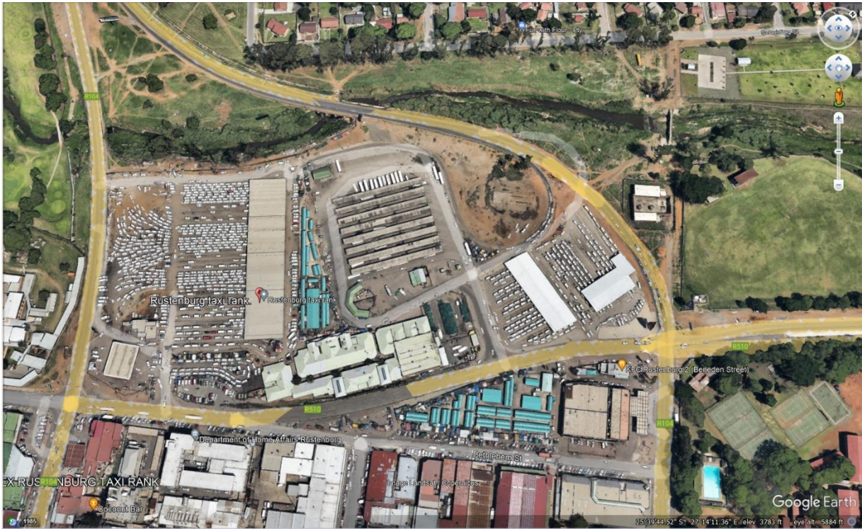
Figure 0-1 Location of Project Site