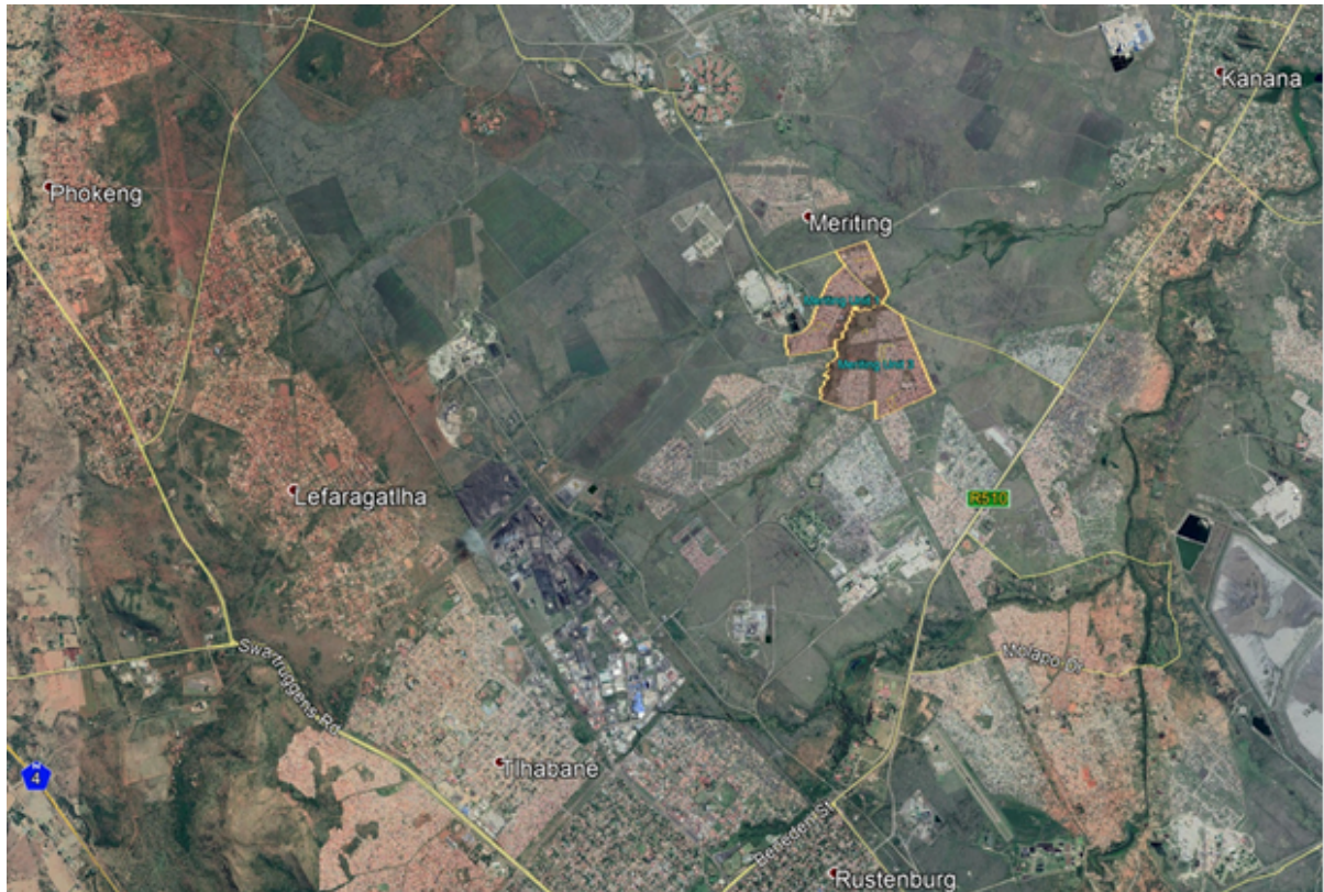
Figure 0-1 Location of Project Site